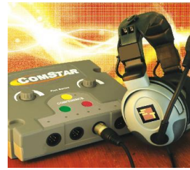
Eartec COMSTAR RF Coms

Light kit - Smith-Victor 401405 SL300 KIT 3-Light 1800-Watt Softlight Location Kit